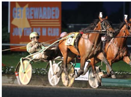
IL VILLAGIO, 2, 1:55.4m

Trained By: Erv Miller Owned By: Brittany Farms, Versailles, KY; Blue Chip Bloodstock Inc., Wallkill, NY; Il Villagio Partners, Versailles, KY 2009 NJSS Events Earnings: $116,550 2009 Total Earnings: $464,521